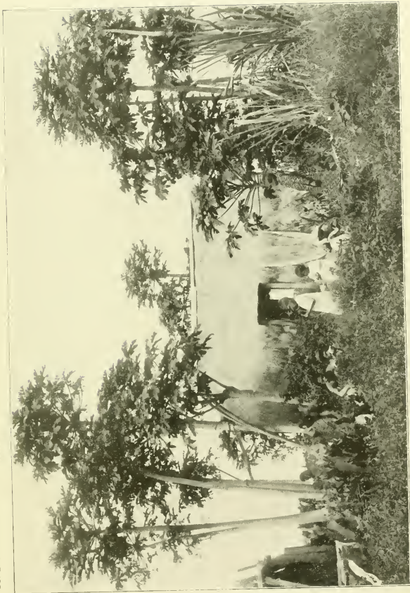
A NATIVE GRASS HOUSE OF THE HUMBLER CLASS (HENSHAW)